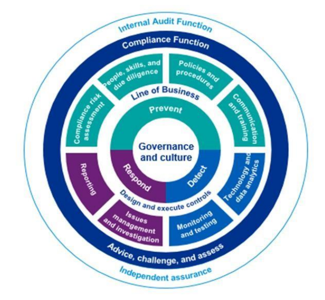
Illustration I: The Compliance Program of Düzey

The following illustration shows the components of the Compliance Program and its composition. This framework reflects the general approach and strategy towards Compliance, i.e., the Compliance Program of Düzey